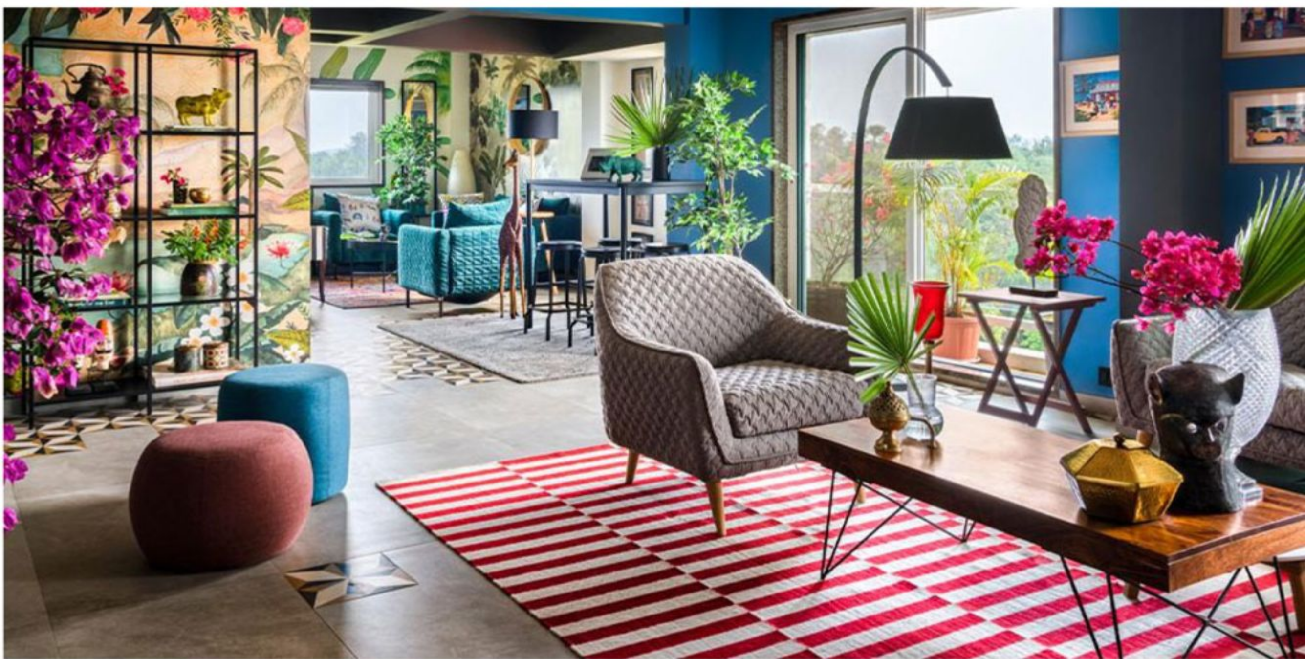
Chairs from Script by Godrej atop an IKEA rug in the living room