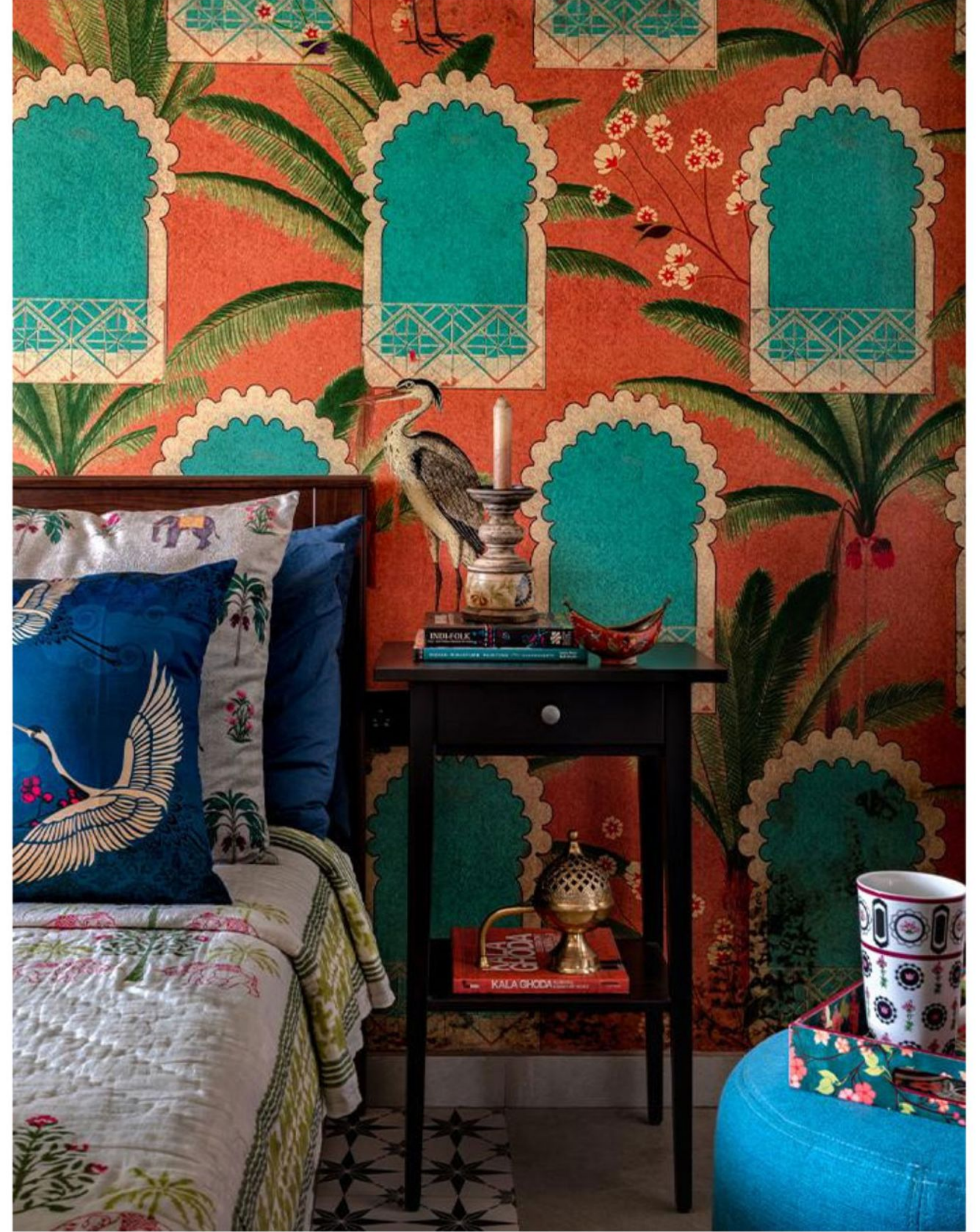
Guest bedroom exudes colour and depth although the colour palette clashes. Wallpaper throughout the house is by India Circus, as is the bed linen. The artefacts are from his private collection