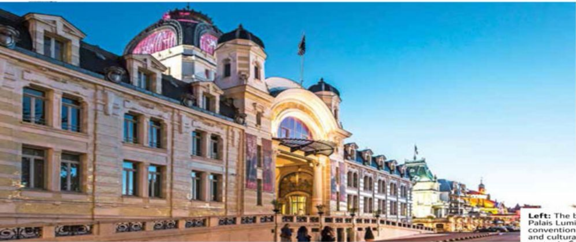
Left: The beautiful Palais Lumière is a convention centre and cultural exhibition centre in Evian. Below: A view of the town from Lake Geneva.

This spread: An aerial view of Evian-les-Bains.