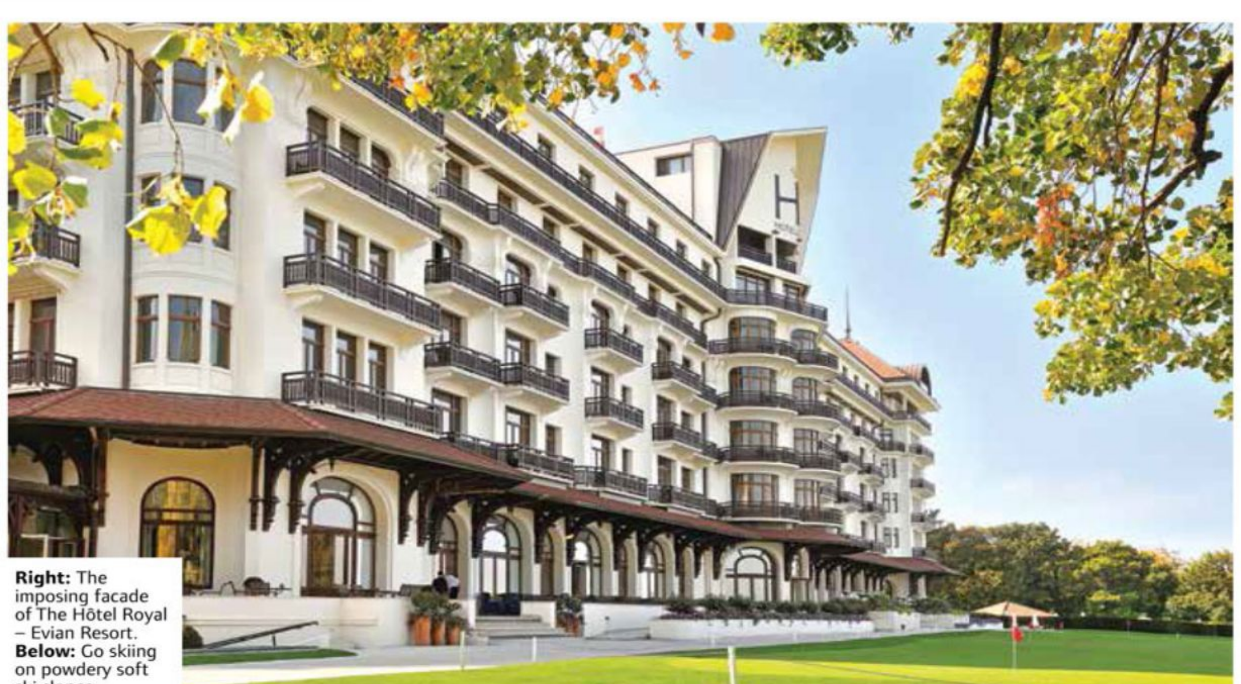
Right: The imposing facade of The Hôtel Royal – Evian Resort. Below: Go skiing on powdery soft ski slopes.

Whilst a bottle of Evian can retail for as much as ₹600 in a Mumbai supermarket, here one can drink as much as one wants from a tap at the source absolutely free! And it's this water that is packed with a cocktail of minerals which is supposedly brimming with rejuvenating